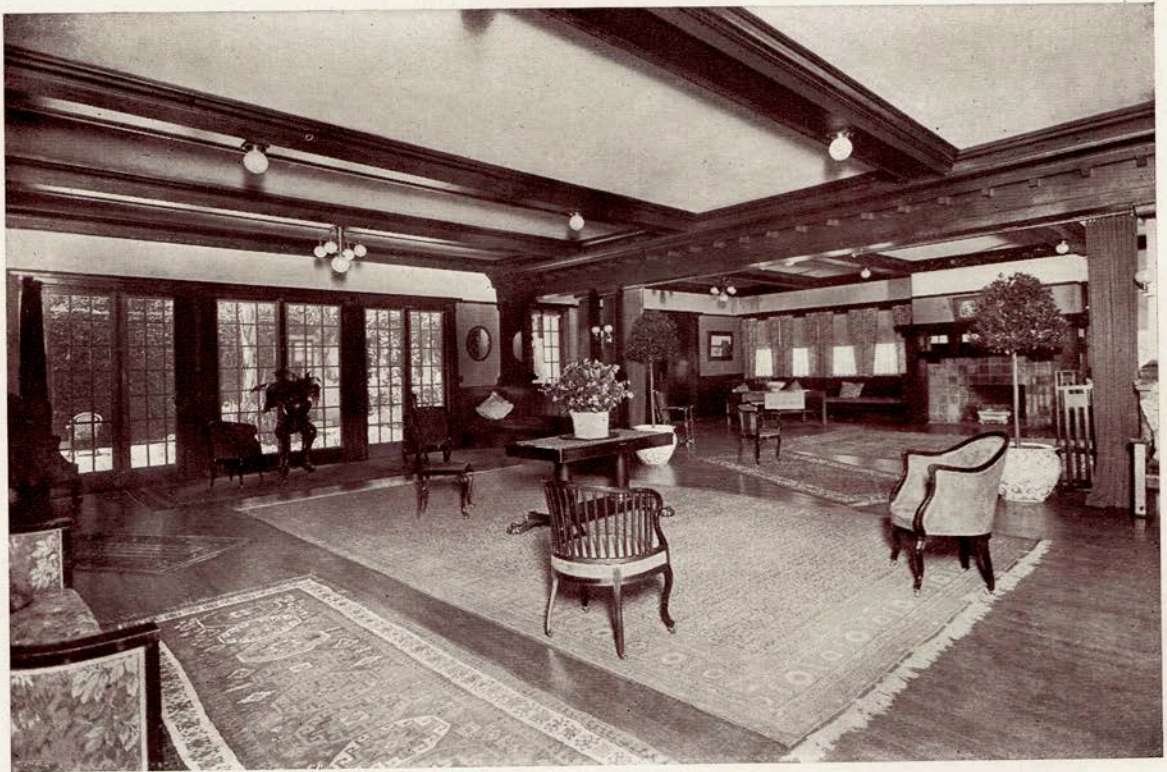
The RECEPTION AND TEA ROOMS