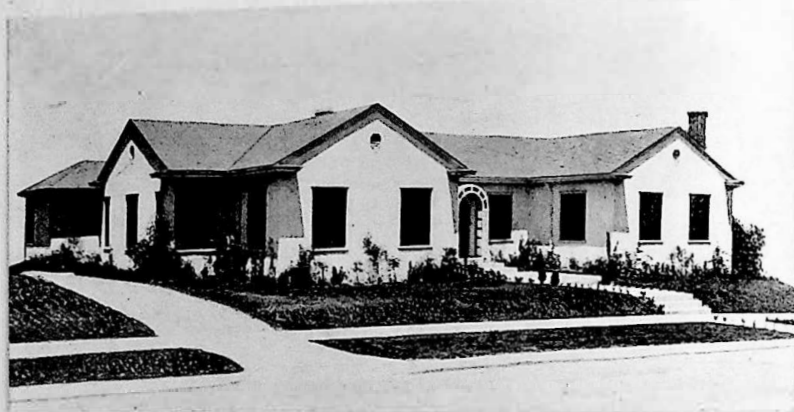
EBELL REST COTTAGE, 135 NORTH PARK VIEW