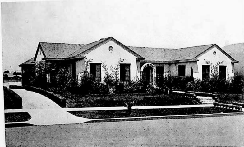
EBELL REST COTTAGE, 135 NORTH PARK VIEW