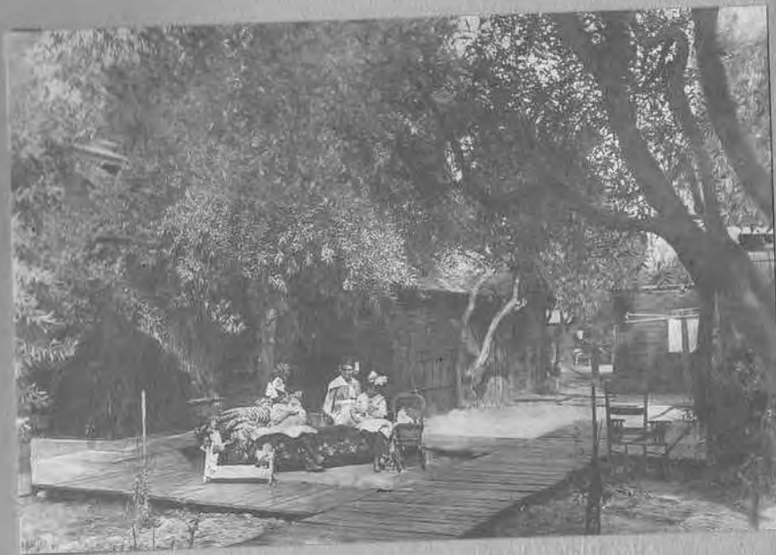
EBELL REST COTTAGE