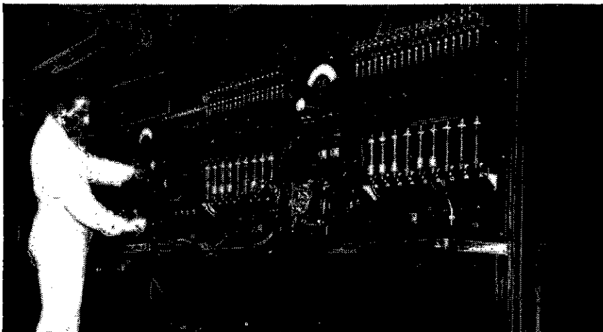
GREER HI-LO MAGNETO TEST STAND , above, tests both high and low tension magnetos, distributors, and coils of Pratt & Whitney and Wright Aircraft engines.