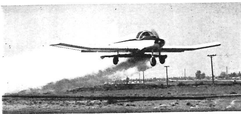
FU-24 AGRICULTURAL AIRCRAFT FOR NEW ZEALAND: Fletcher Aviation Corp., of El Monte, Florida, has announced shipment of three more FU-24 agricultural utility aircraft to New Zealand. Shipped in pre-fabricated kits, the aircraft can be assembled by local labor using simple hand tools. Over 60 of the unique FU-24's are in use in New Zealand today.

CPA's new tourist class fare from Vancouver to New York will be slightly lower than the lowest fare now in