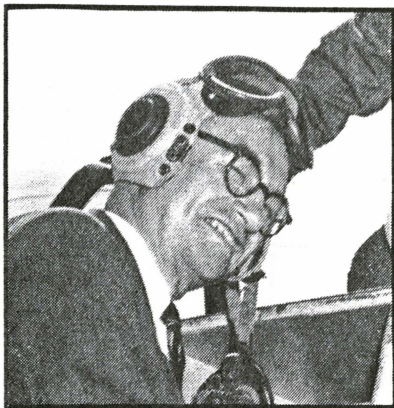
HON. BROOKE CLAXTON