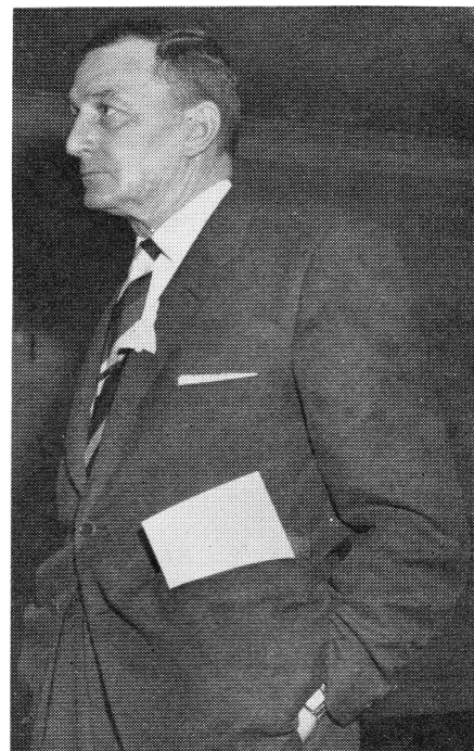
Carmen Core, Mayor of Brampton, announced that representatives of 18 municipalities in and around Metropolitan Toronto would meet with Prime Minister Diefenbaker to emphasize the economic importance of maintaining full employment at the Avro and Orenda Plants. More than 50 representatives met with District 717 Reps. on Wednesday, Jan. 14th at the Royal York Hotel.