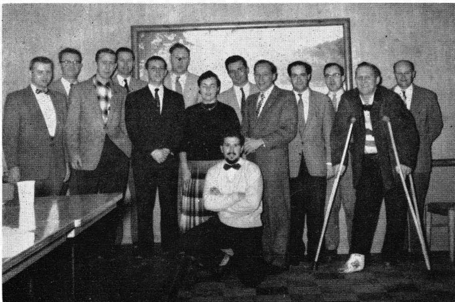
LODGE 1922 EXECUTIVE BOARD FOR 1959