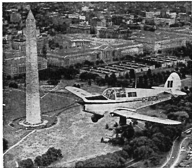
The Percival Proctor V, used by the air attache for his goodwill tour of the West Indies, flying past the Washington Monument in the U. S. capital.

The only light aircraft of British registration located permanently in the USA at the present time is the Percival Proctor V owned by His Majesty's government and stationed in Washington for the use of the Civil Air Attache and his staff at the British Embassy.