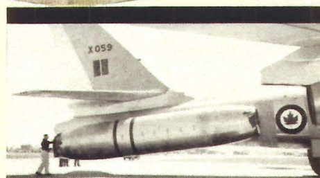
FLIGHT TESTING THE NEW IROQUOIS AT MALTON The supersonic Iroquois is carried in this specially designed pod at the rear of a B-47.

The Iroquois designed, developed and produced by Canadians is the supersonic successor to the Orenda jet engine, 4,000 of which are in service on four continents.