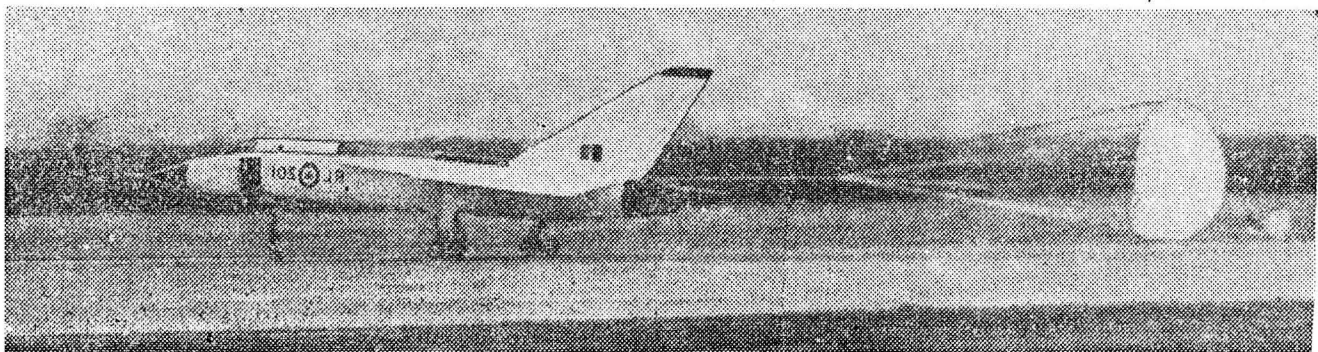
Brake parachute brings aircraft to stop after it hit runway at 184 mph. —John Gillies.