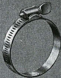
AN737-TW TYPE WWD (Tangential— with one-piece housing)

STANDARD OF THE INDUSTRY FOR OVER A QUARTER CENTURY