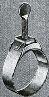
AN737-RM TYPE FBSS (Radial—with floating bridge)