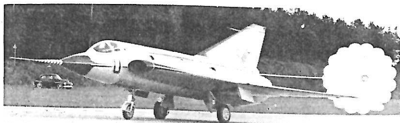
THE DRAGON: Under development in Sweden for the Royal Swedish Air Force is the Saab J-35 Draken (Dragon). The Draken can fly supersonically in level flight and features a "double delta" wing, an advanced configuration that has been developed exclusively in Sweden, the layout first being used on the Saab 210 research aircraft, which started flying early in 1952. Power is by a Rolls-Royce Avon with afterburner. A Saab ejection seat is fitted for the crew of one.