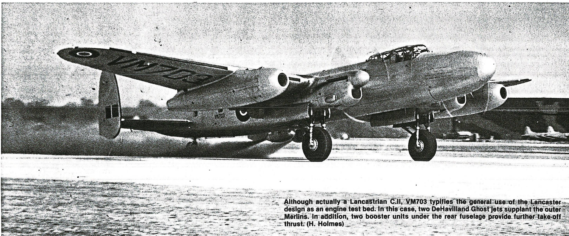
Although actually a Lancasterian C.II, VM703 typifies the general use of the Lancaster design as an engine test bed. In this case, two DeHavilland Ghost jets supplant the outer Merlins. In addition, two booster units under the rear fuselage provide further take-off thrust. (H. Holmes)