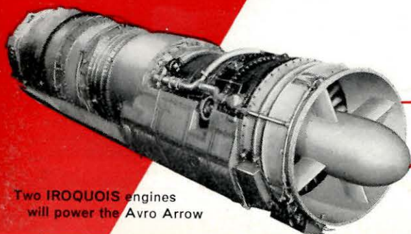
Two IROQUOIS engines will power the Avro Arrow

Today, less than a lifetime later, over 60,000 horsepower in Orenda's IROQUOIS turbojet—an engine six times the combined weight of the 'Silver Dart', its engine, pilot and fuel.