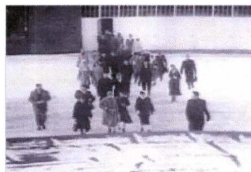
Employees leaving Avro that day

That day 14,525 workers were to leave the Avro plant unemployed. A small percentage were rehired later, but the vast majority were cast into the job market. The employees at Avro found out pretty quickly that their jobs were on the line when a loudspeaker announced the PM's decision at 11:20 a.m. They were at first told to keep working until further notice. That came later in the day, after several meetings by the management. All paid employees were to be immediately laid off.