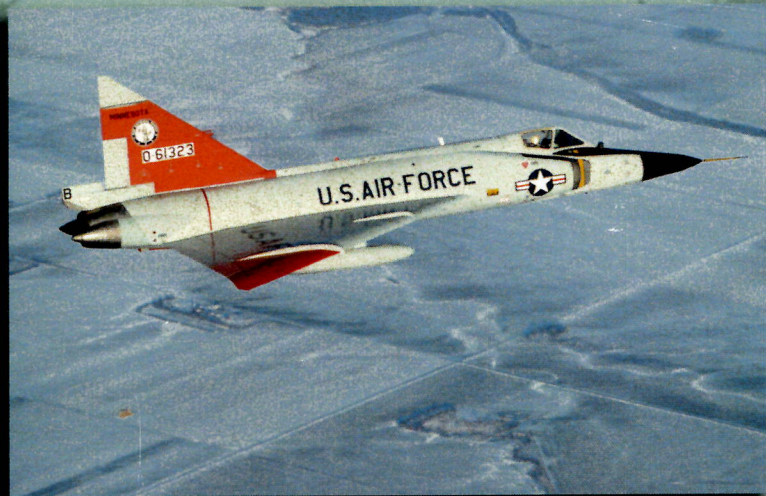
F-102 Delta Dagger Pilot's Flight Operating Manual

Originally printed by Convair and the USAF, this F-102 Flight Operating Manual taught pilots everything they needed to know before entering the cockpit. Classified "Restricted", the manual was recently declassified and is here reprinted in book form. This affordable facsimile has been reformatted and color images appear in black and white. Care has been taken however to preserve the integrity of the text.