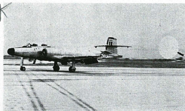
Avro CF-100 tests use of retractable parachute in landing: developing techniques to be used in the CF-105.