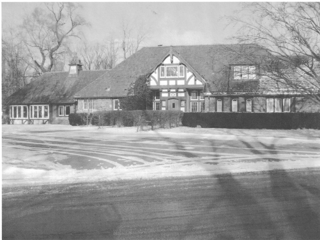
AVRO "BRINK CREST"