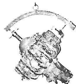
An R-1380 Engine being rolled into "In-Flight" position.

The Tilt-Arc engine sling allows you to roll any radial engine from "Shaft Vertical" position to "In-Flight" position while suspended. It will accommodate any size or type of radial engine within the weight limits of the sling.