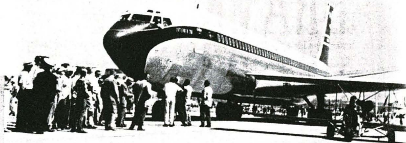
The Globemaster and the "707". Representing the gigantic in both the propellor driven and the pure jet.