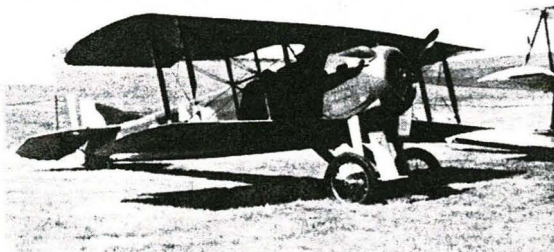
The Legendary Spad and controversial 'replacement', the Bomarc.