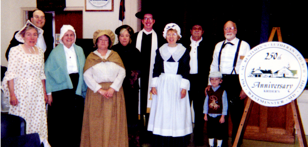
The first 250th Anniversary historic service, January 2011.

anniversary of Grace Church, accepts August 12, 1761, as the founding date of St. Benjamin's.