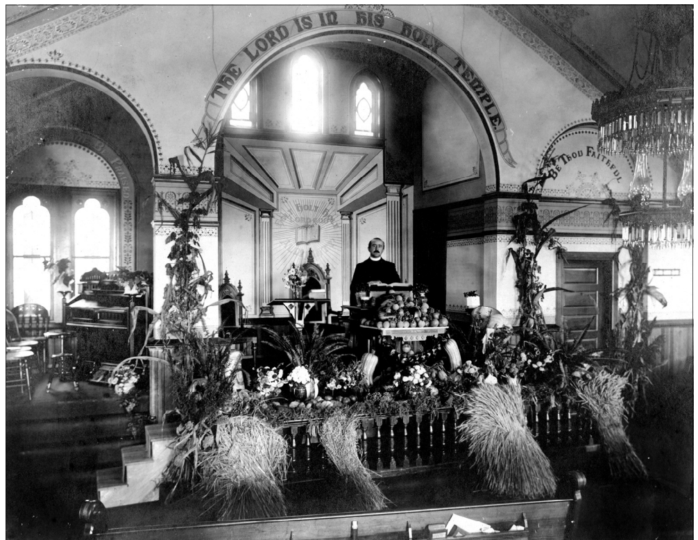
Interior of the current church at a Harvest Home service, c.1910.

In 1889, lightning struck the second Union Church, rendering it unsafe. The Lutheran members, who now outnumbered those of the Reformed congregation, decided to build their own, separate church on two and a half acres they bought for $500 just south of where the Union Church had stood. On June 15, 1890, they laid the cornerstone for a Queen Anne-style church measuring 40' x 48', with an additional Sunday school room on the left side of the building. A week earlier, the Reformed congregation had begun a Gothic-style church several hundred yards to the north. Salvageable materials from the demolished church were divided between the two congregations, with the Lutherans incorporating the old cornerstone in their new foundation and the Reformed members placing the 1809 "Benjamin's Kerch" stone above their new front door. The denominations went their separate ways, although on good terms, as they continued sharing the large, historic cemetery between them. The Lutherans began to refer to their church as St. Benjamin's, while members of the Reformed (later United