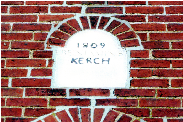
The St. Benjamin's kerch stone in its place of honor above the door of the 1890 Reformed church (now United Church of Christ).