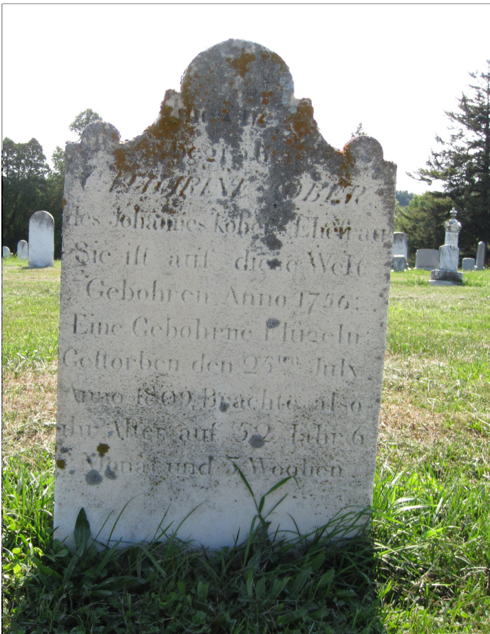
One of the many German-inscribed markers in the joint cemetery.

Under Rev. Brenneman's leadership, the congregation enlarged and renovated the 1890 church building to address the over-crowded conditions of the adult Sunday school. Limited space forced four separate classes—the young men of the "Willing Workers," the young women of the "Gleaners," and the adult Men's and Women's Bible Classes—to conduct instruction in the four corners of the sanctuary. In 1951 St. Benjamin's added a Sunday school auditorium and some additional classrooms, extended the church itself 27 feet, increasing seating capacity to 275, installed new hardwood floors, and created a sound-proof room above the narthex so that mothers and young children could see but not be heard.