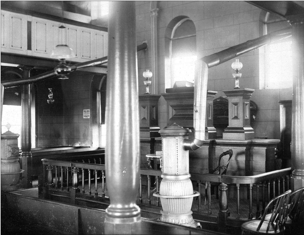
Interior of the brick Union Church showing the balcony, stoves, pipes, and woodwork.

The original "Church Record of the Evangelical Lutheran Congregation of St. Benjamin's or Krider's Church at Pipe Creek, near Westminster, Md., 1767-1837" is written entirely in German (translated into English in 1935 by Charles T. Zahn). Only on May 27, 1826, does the first reference to English appear in the original record, when 17 worshipers were confirmed in German, two in English.