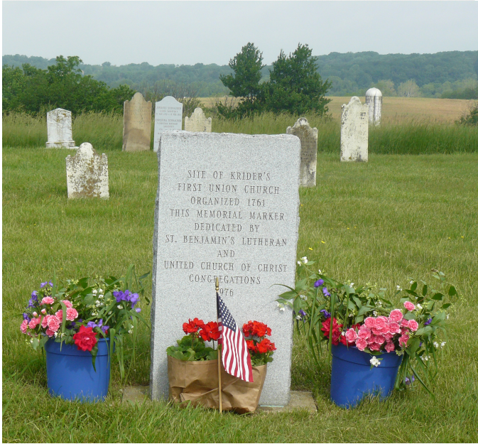
Marker erected on site of original log Union Church in 1976 during the American bicentennial celebration.

march to the 1976 marker erected by the Lutheran and Reformed congregations on the site of the original log church. The congregation honored six veterans of the Revolutionary War and five more from the War of 1812 who were buried in the cemetery, perhaps the oldest burying ground in the county.