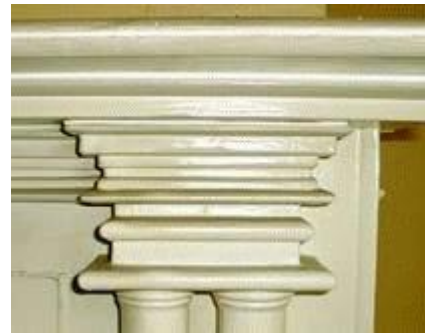
The front entrance columns and pediment, widened doorways and columns in the front hall, and first floor mantels were among the alterations made in 1905.