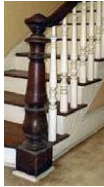
Newel post and balusters, first floor staircase