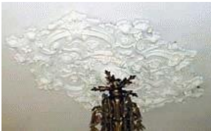
Detail, plaster ceiling medallion