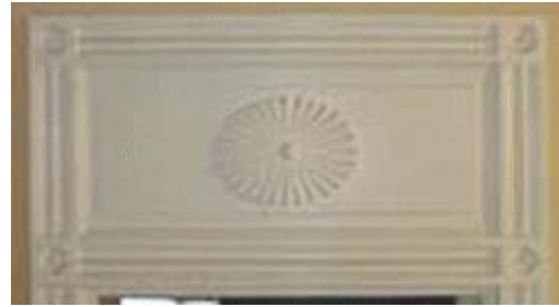
Detail, first floor doorway

The moldings used are symmetrical, and employ corner blocks. These are rarely seen in Carroll County until the late 1830's. The earliest known use of the lancet profile, seen here on the doorway to the west-center room, is in the Robert Mills-designed Richard Potts House in Frederick, of 1817-19. Mount Pleasant, outside of Union Bridge, also has this feature, and dates to c.1818-1823. Thus, its use at Cockey's puts the building at the stylistic forefront for the region. This should not be too surprising, though, since the use of the entablatures over the wide doorways, and the panels over the narrow doorways, are also unusual, and much grander than what is typically found. Regardless of its intended function when it was constructed, the Cockey's Tavern building was meant to impress.