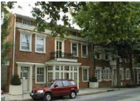
218 East Main Street

It also must be kept in mind that the building at 218 E. Main Street was apparently part of the tavern property, and seems to have been built contiguously with the tavern, perhaps as the tavern keeper's residence. No photograph of Cockey's Tavern has been found dating from the nineteenth century, so we do not know what it looked like, but it may have been similar to 218 E. Main Street. The 1887 Sanborn map shows both as 2 ½ story buildings, while most other buildings are two stories, or occasionally three. Additional research on that building, and a careful analysis of its fabric, may help in the understanding of Cockey's Tavern.(7)