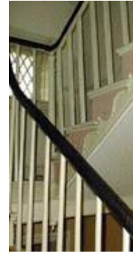
Balusters, third floor staircase