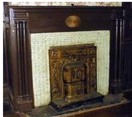
Fireplace, first floor parlor