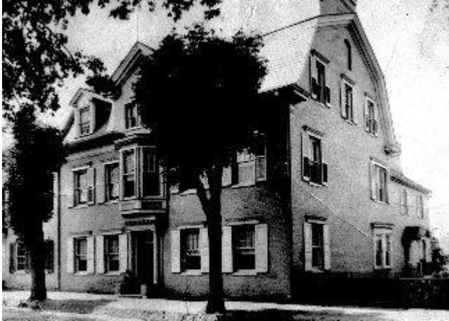
The Charles Fink home, c.1910

do not indicate any changes to the porches, but the round-arched sash in the southeast wall of the passage is consistent with the other 1905 changes. This suggests that the northern-most room in the porch was enclosed at this time. There are wood columns partially exposed in the fire-damaged walls of the south porch room, suggesting that this part of the porch remained open, or became a sleeping porch for the Finks. The dormer windows were added, of course, with the roof. The third floor was laid out with a transverse passage, with a large room in the front center that reads as a sitting room, large rooms in the four corners that each had their own sink, and two small rooms flanking the original stairway. Earlier photographs show that the building was painted, and though it has been stripped, there is still evidence that it was once painted a brick red with white penciling, or mortar lines. This could date from as early as the construction of the building, as such a paint treatment was noted in Lancaster in 1801, (13) but could also have been used to conceal changes in the brick work made in the 1905 alterations. The brick work below the first story windows has been altered or repaired on several occasions, for as yet unknown reasons, and this could be one of a number of changes that it was sought to hide.