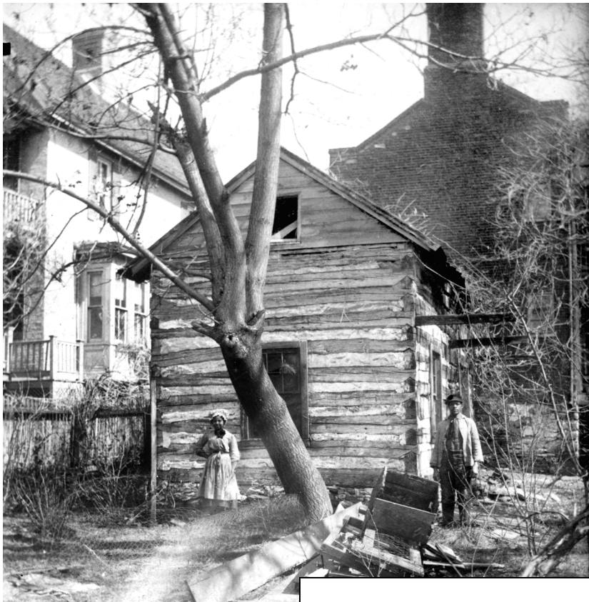
Above: c.1900 image of the Shellman yard showing the loom house.