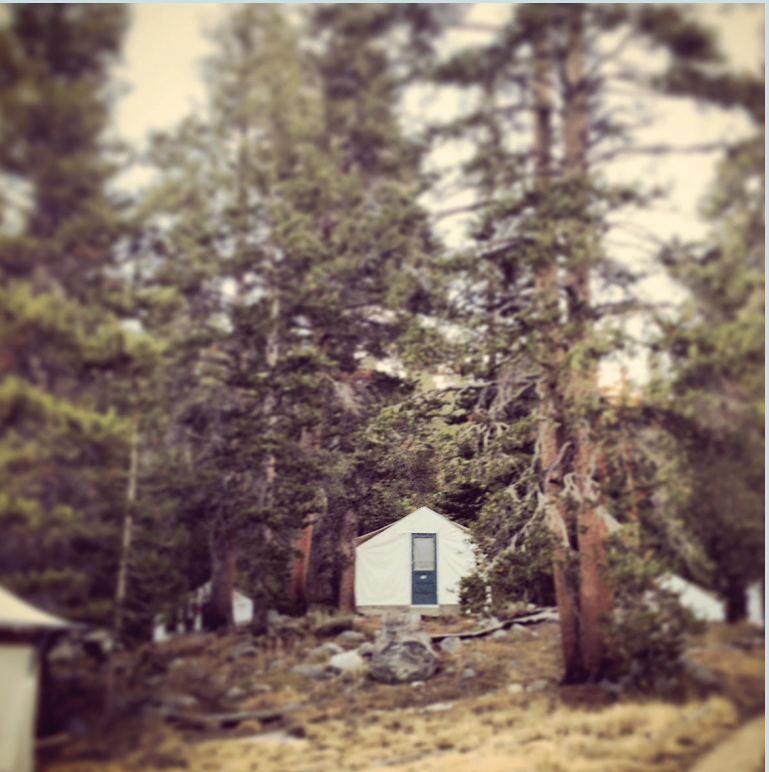
Tuolumne Meadows Lodge