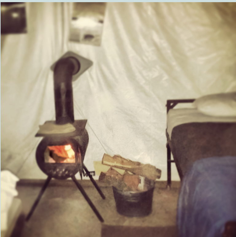
White Wolf Lodge

Best Western, Oakhurst Tenaya Lodge, Fish Camp