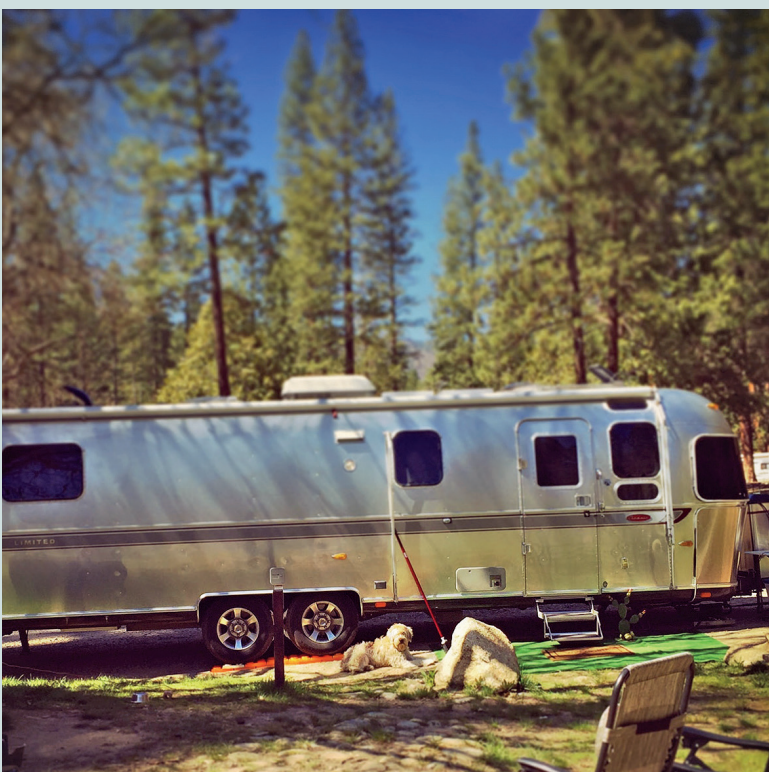
Upper Pines Campground