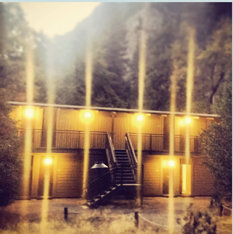
Yosemite Lodge at the Falls