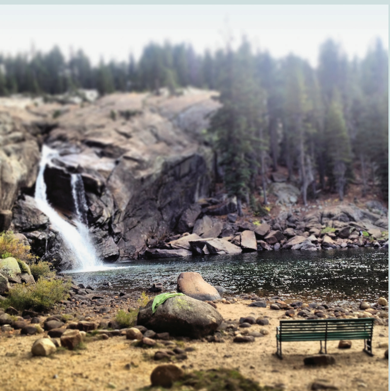
Glen Aulin High Sierra Camp