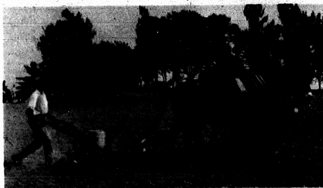
ACTION IN THE TOBACCO FIELD —This type of machine shown here in use in Maryland sows, mixes fertilizer with soil and lifts all in one operation.

During this winter farm hands have been getting the highest pay they have received in four years, according to the