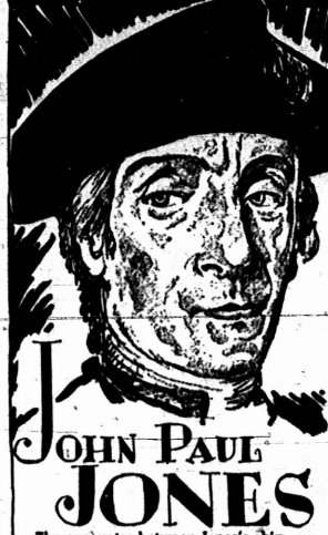
JOHN PAUL JONES

The encounter between Jones's ship, the "Bon Homme Richard," and the British frigate, the "Serapis," was one of the most famous sea engagements of history in a fierce three-and-a-half-hour battle, fought by moonlight. Jones, his own ship badly shattered, nevertheless forced his superior opponent to strike her colors.