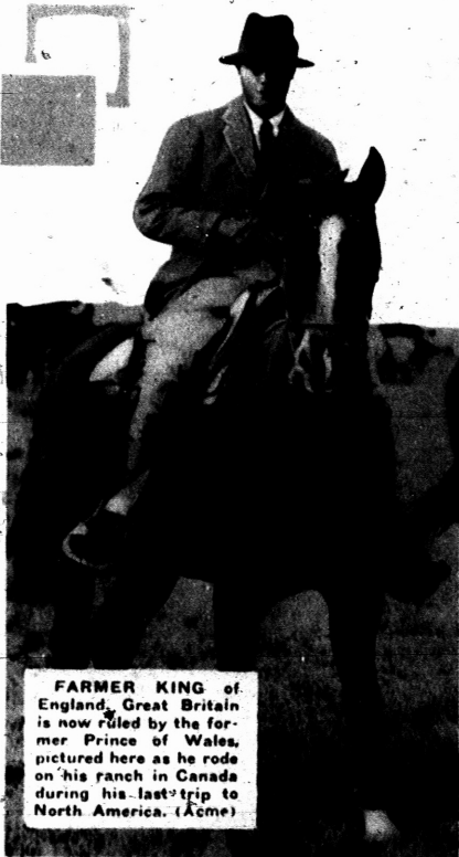
FARMER KING of England, Great Britain is now ruled by the former Prince of Wales, pictured here as he rode on his ranch in Canada during his last trip to North America.