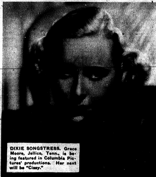
DIXIE SONGSTRESS. Grace Moore, Jellico, Tenn., is being featured in Columbia Pictures' productions. Her next will be "Cissy."