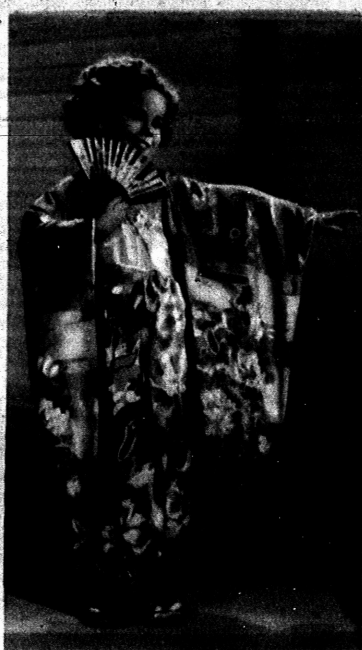
JAPANESE film fans presented Shirley Temple with this handmade silk kimono. So Shirley plays another role.