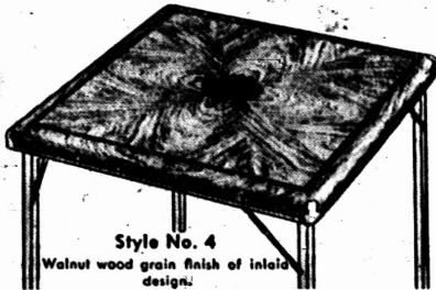
Style No. 4 Walnut wood grain finish of inlaid design