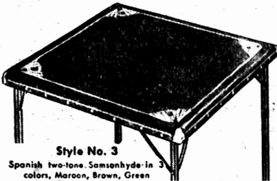
Style No. 3 Spanish two-tone Samsonhyde in 3 colors, Maroon, Brown, Green