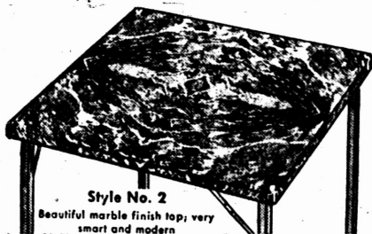
Style No. 2 Beautiful marble finish top, very smart and modern

SHOP- EARLY WHILE SELECTIONS ARE THE BEST