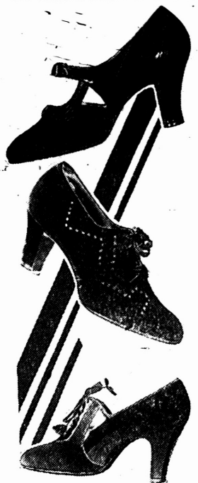
New York-Paris Fashions

turn this money is used to carry the Red Cross work of mercy to distressed citizens. Membership is open to all, without regard to race, color or creed, and the Red Cross services are given to all, without restriction. The annual Roll Call for members is held Armistice Day to Thanksgiving Day, November 11-28. The poster for 1936, as by Walter W. Seaton, noted illustrator and painter of movie and radio stars.