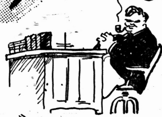
"THE OLD HAVE WISDOM THAT THE YOUNG KNOW NOT OF" HE ONCE WROTE