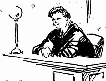
HAS HANDED DOWN SOME OPINIONS THAT HAVE BECOME FAMOUS AND IMMORTALIZED IN KENTUCKY JURISPRUDENCE.