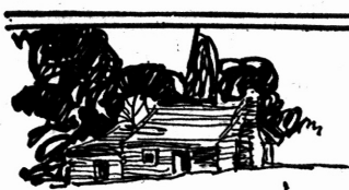
BORN IN A LOG HOUSE IN KENTUCKY