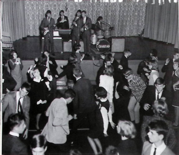
No, it's not calisthenics, just freshmen getting acquainted at the first fall dance.