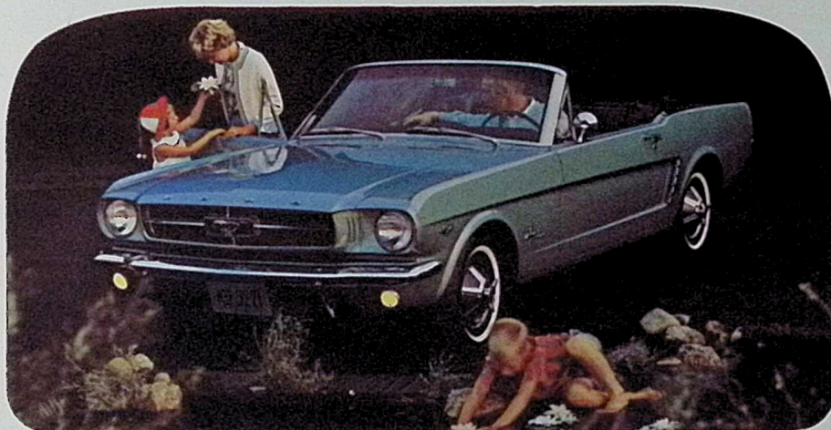
The sporty '65 Mustang Convertible is a new reason for liking convertibles, as versatile as a convertible can be.