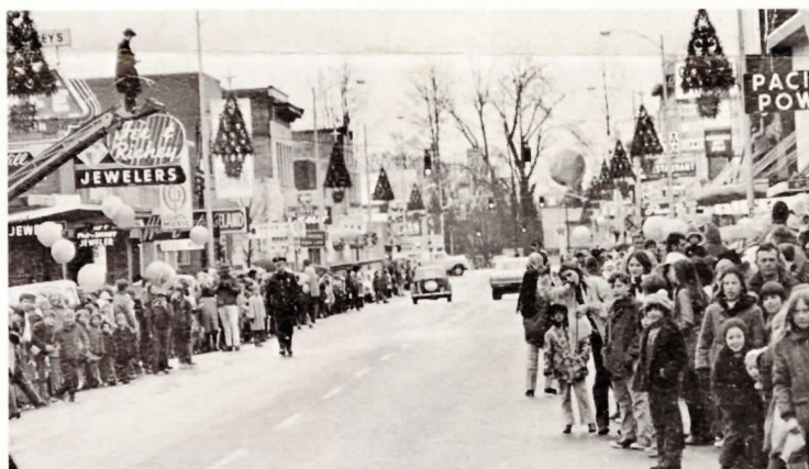
Springfield New Christmas Decorations Add Color Gaiety to Holiday Season