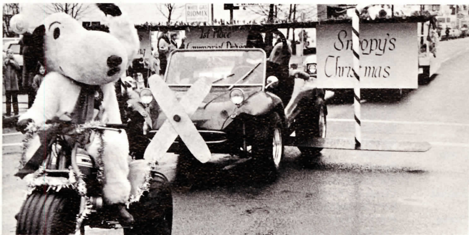
SPRINGFIELD'S 18TH ANNUAL CHRISTMAS PARADE was an outstanding success. Here is one of the more than 66 parade entries. Over 20,000 viewers lined the 2½ mile parade route.

I am looking forward to this year and ask all of you to join in the work of your Chamber in 1972. Thank you.