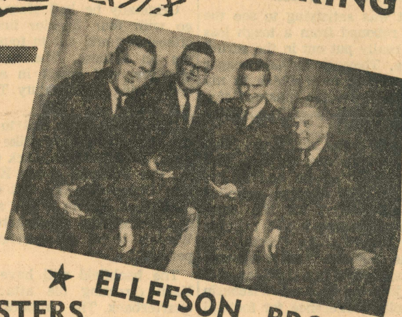
★ ELLEFSON BROS.