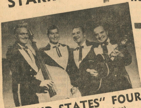
★ "MID STATES" FOUR (Former International Champions)