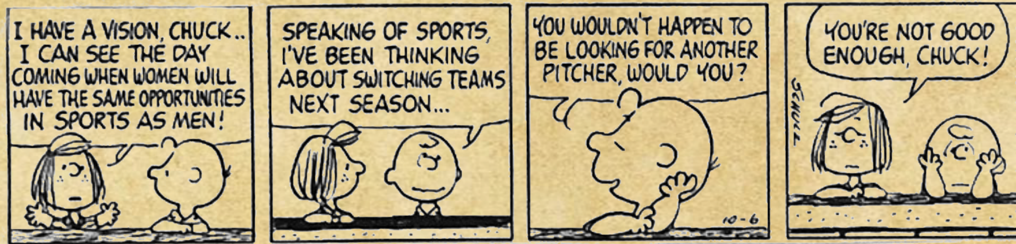
Peanuts-October 6, 1979

Charles Schultz, the creator of Peanuts, passionately believed in girls' and women's sports. He used his platform to promote Title IX. Schulz was a close friend of Billie Jean King and in 1979 he highlighted the issue of females in sports with a multi-day storyline in his comic strip. Schulz brought attention to women athletes by mentioning contemporary female sports stars and having his girl characters participate in a wide variety of sports, from football to figure skating. From Peppermint Patty's athletic dominance to Lucy's ineptitude in the right field to Marcie's total bewilderment with sports of all kinds, the girls in Peanuts were always equal participants.