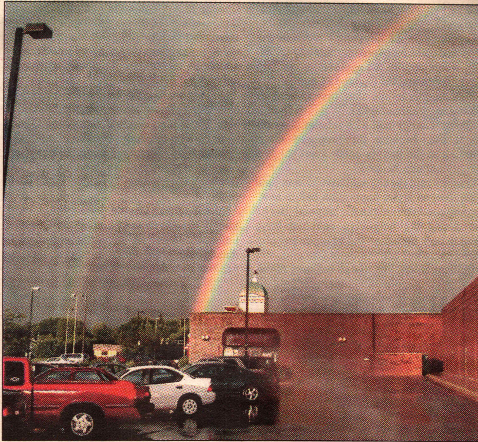
A double rainbow appeared in the Stevens Point area on Wednesday, July 7, a day when local tornadoes were reported. This photo was taken outside CenterPoint MarketPlace after audience members at the city band concert saw the rainbows thru the skylight.