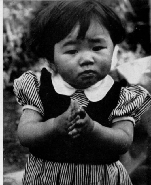
What's going to happen to me?

The United States is engaged in a war which President Roosevelt calls a defense of "liberty, decency, justice." It is no time to avoid dealing with injustice at home, especially when that injustice will have results which will so directly condition the post-war world.