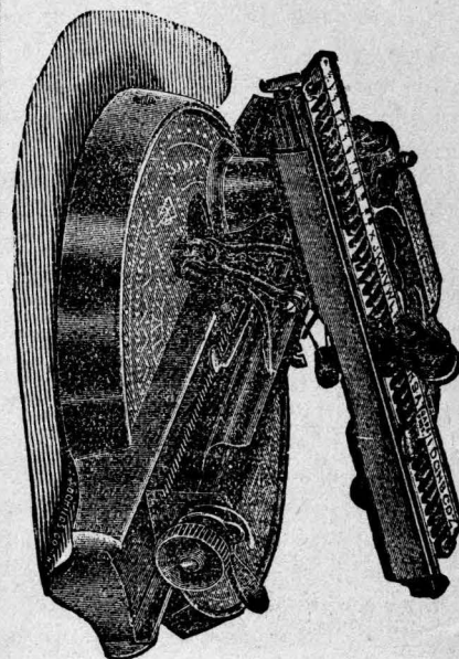
The Odell Type Writer.

LONDON CLOTHING CO., CORNER SPRING AND TEMPLE STR., LOS ANGELES.