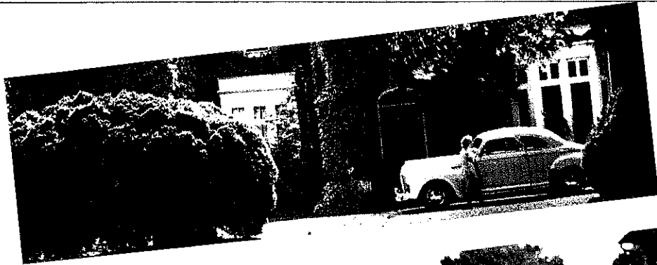
where he served as the commander of the 1st Cavalry Division, general of the Army. He died within a decade and his wife remained with the property until she traded it for land in Camden, New Jersey. In 1954, the Glenelg County School opened. Recently a new high school has been added to the campus of this private institution.