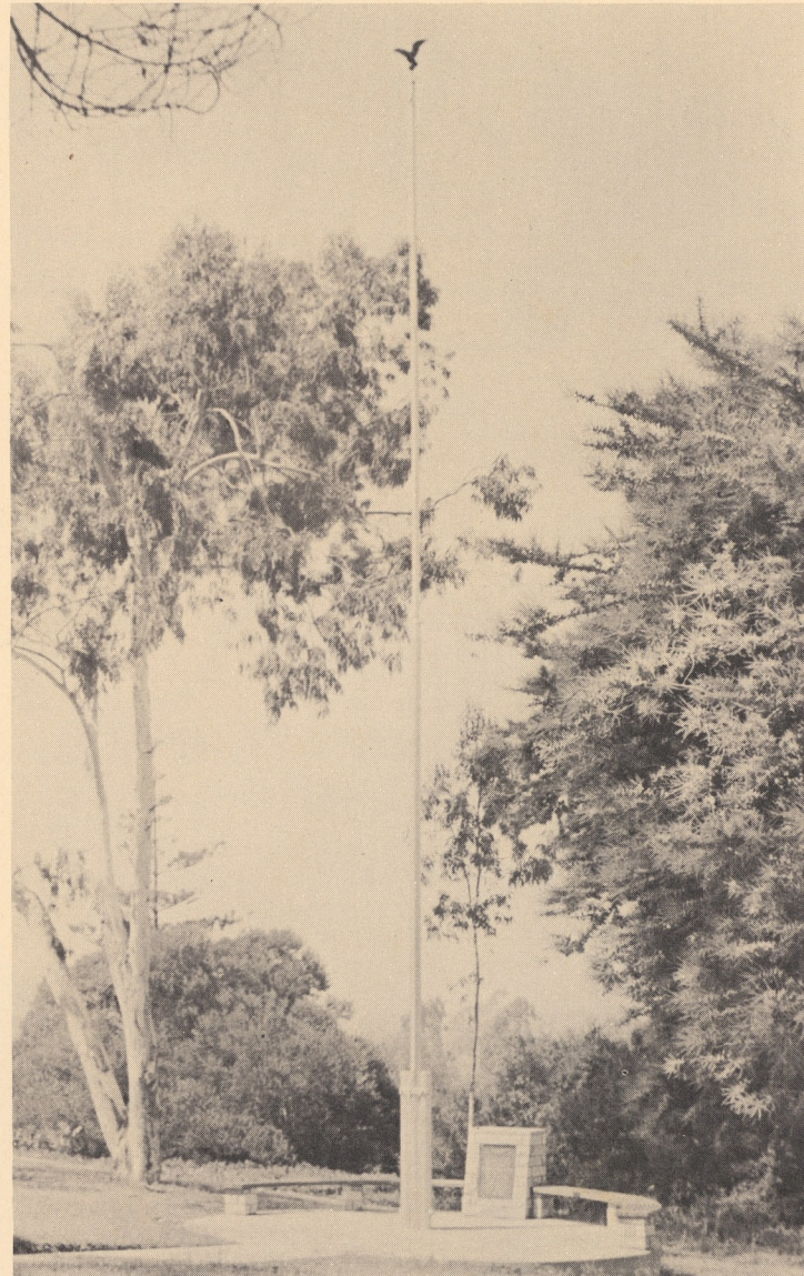
MEMORIAL FLAGPOLE — This 40-foot high flagpole with bronze plaque is the John B. McGrew Memorial to be dedicated Oct. 9, 2 p.m., at the site in front of the old school house.