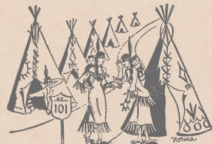
My Dear, We Found the Cutest Wigwam at Perry's

Via de Santa Fe At La Flecha Telephone PL 6-1111