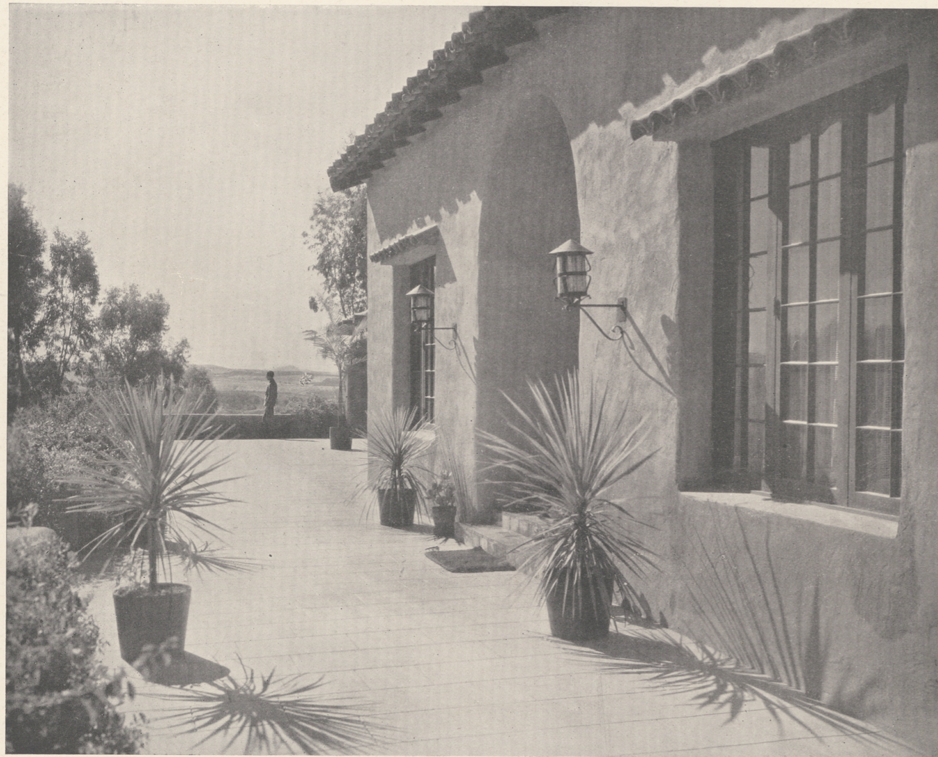
The terrace and entrance to La Morada reflect splendidly the spirit of hospitality that pervades this charming inn

While these specialists are directing their skill toward the creation of some of the most attractive homesites in Southern California, Max Behr, golf course architect, is expecting to reach the climax of his career on the adjacent fairways and George Washington Smith of Santa Barbara is being relied upon to create in clubhouse designing another bit of brilliance for which his name is famous.