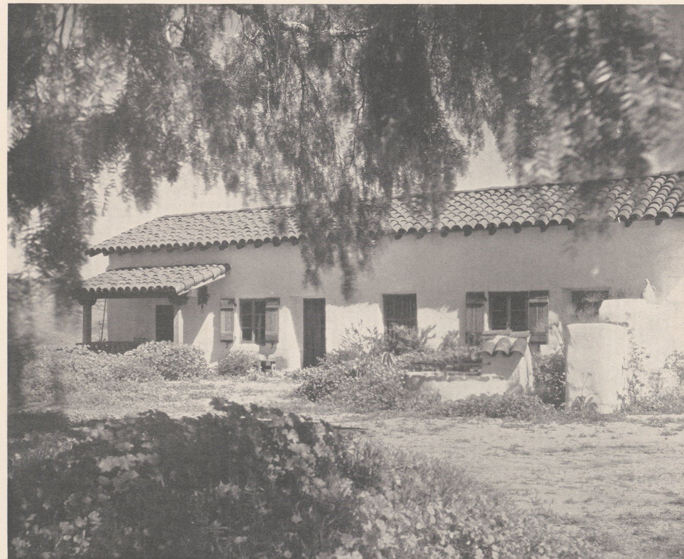
Tile from Pala Mission manufactured by hand a century ago helped to lend charm to this historical place. Clever treatment made the well in the foreground an interesting detail of the place