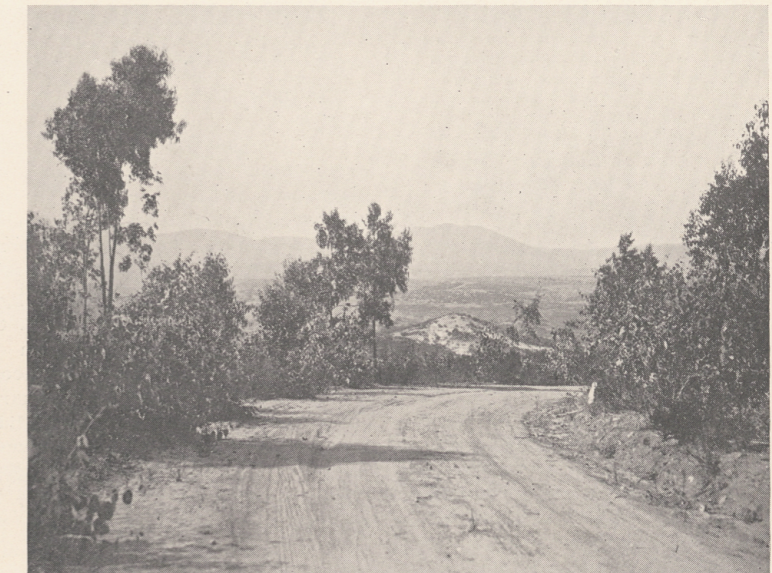
A charming glimpse of Rancho Santa Fe scenery