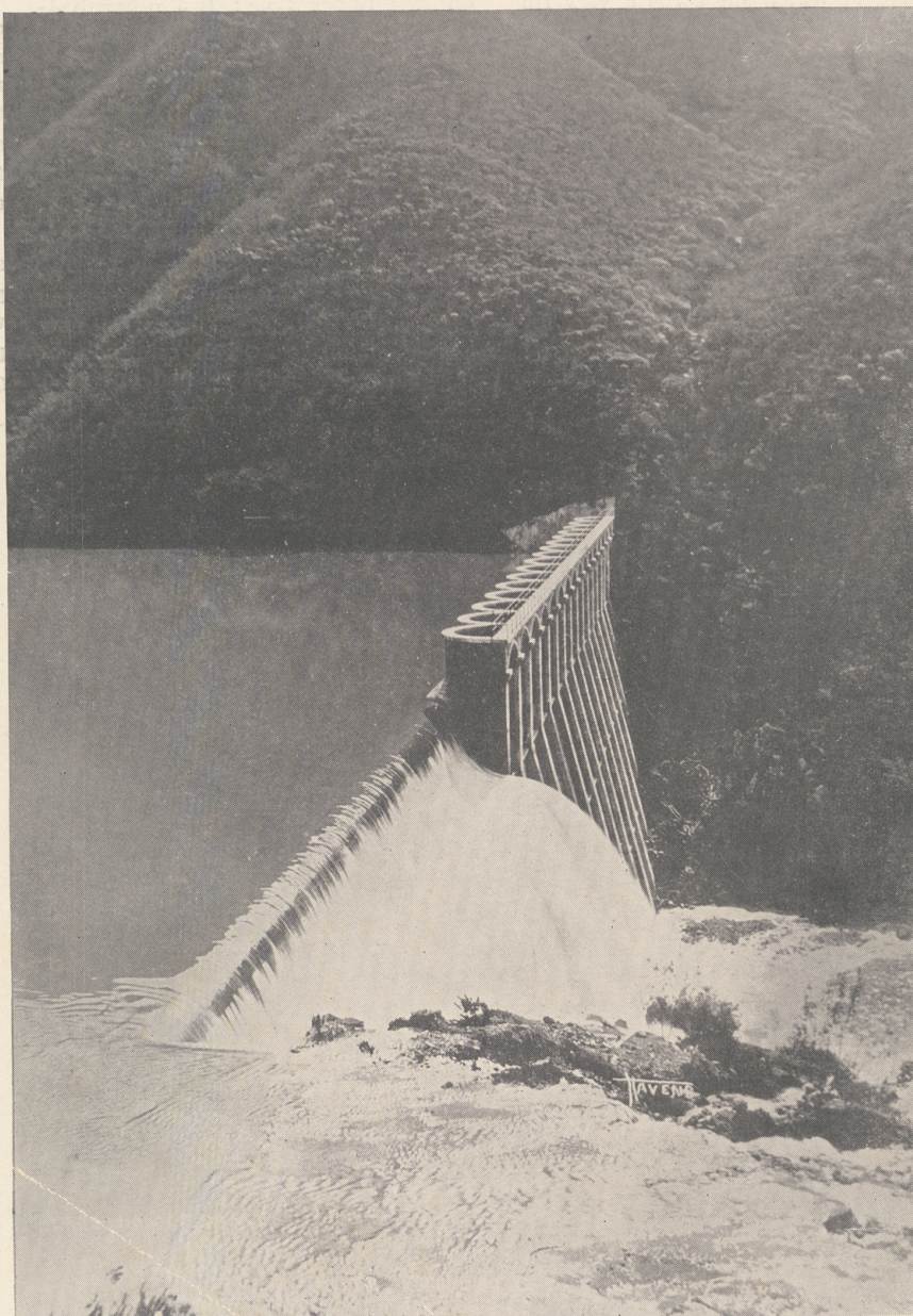
There is a definite feeling of power and ampleness in this early photograph of Hodges Dam, source of Rancho Santa Fe water