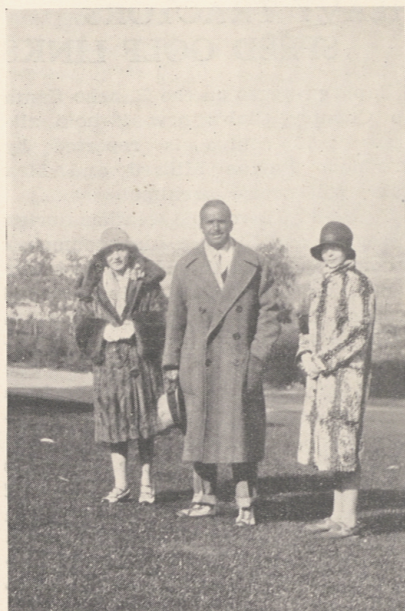
Mary Pickford, Douglas Fairbanks and Lillian Gish snapped on a recent visit to Rancho Santa Fe.

Already the Rancho Santa Fe covenant is causing much favorable comment among city officials and planning commissions throughout California. While similar covenants have been