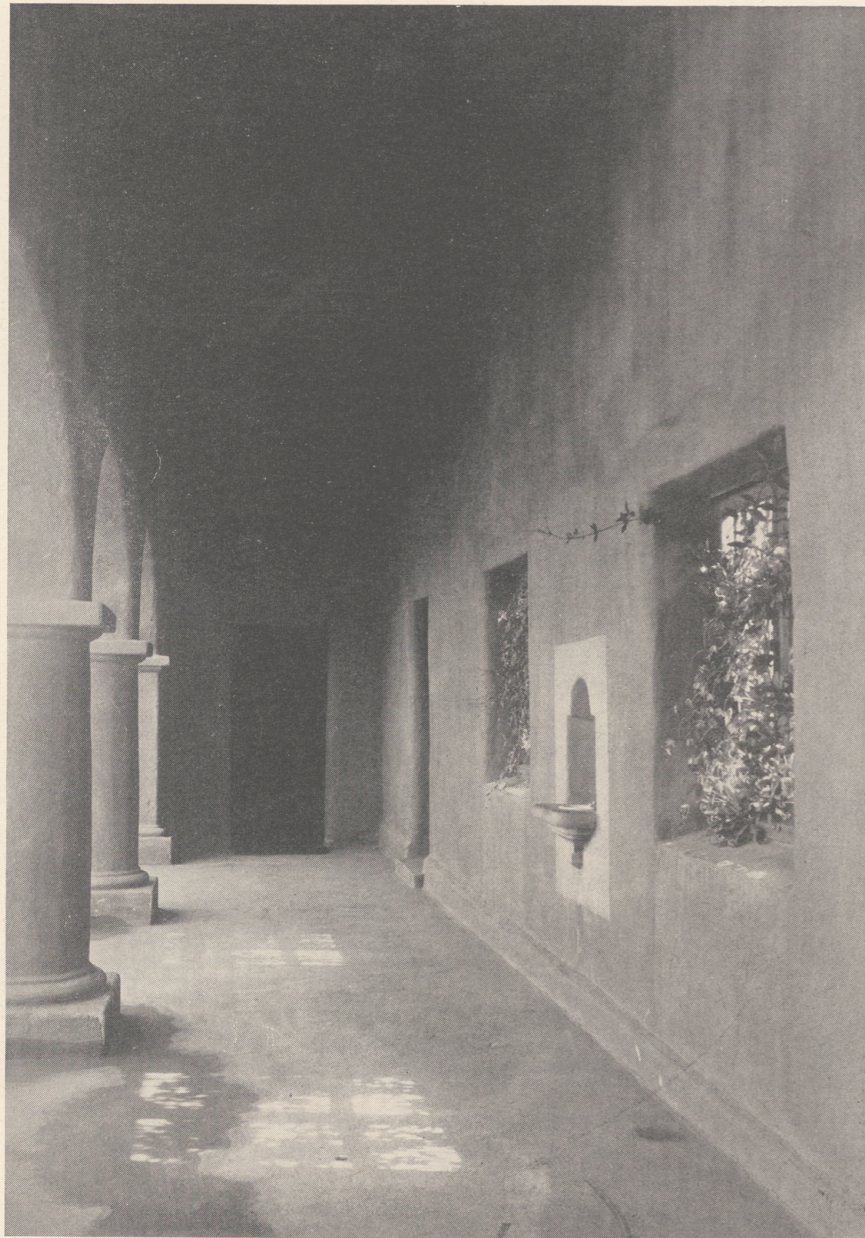
A striking view of the arched corridor of the Administration Building