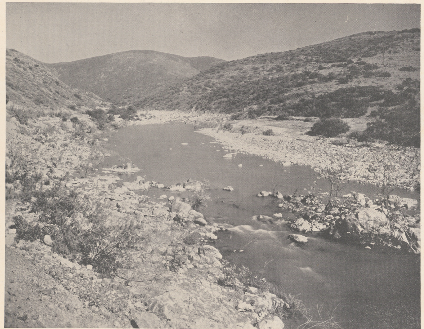
A glimpse of green clad hills along the San Dieguito river. Unfortunately the camera fails to register the color that makes this scene alluring