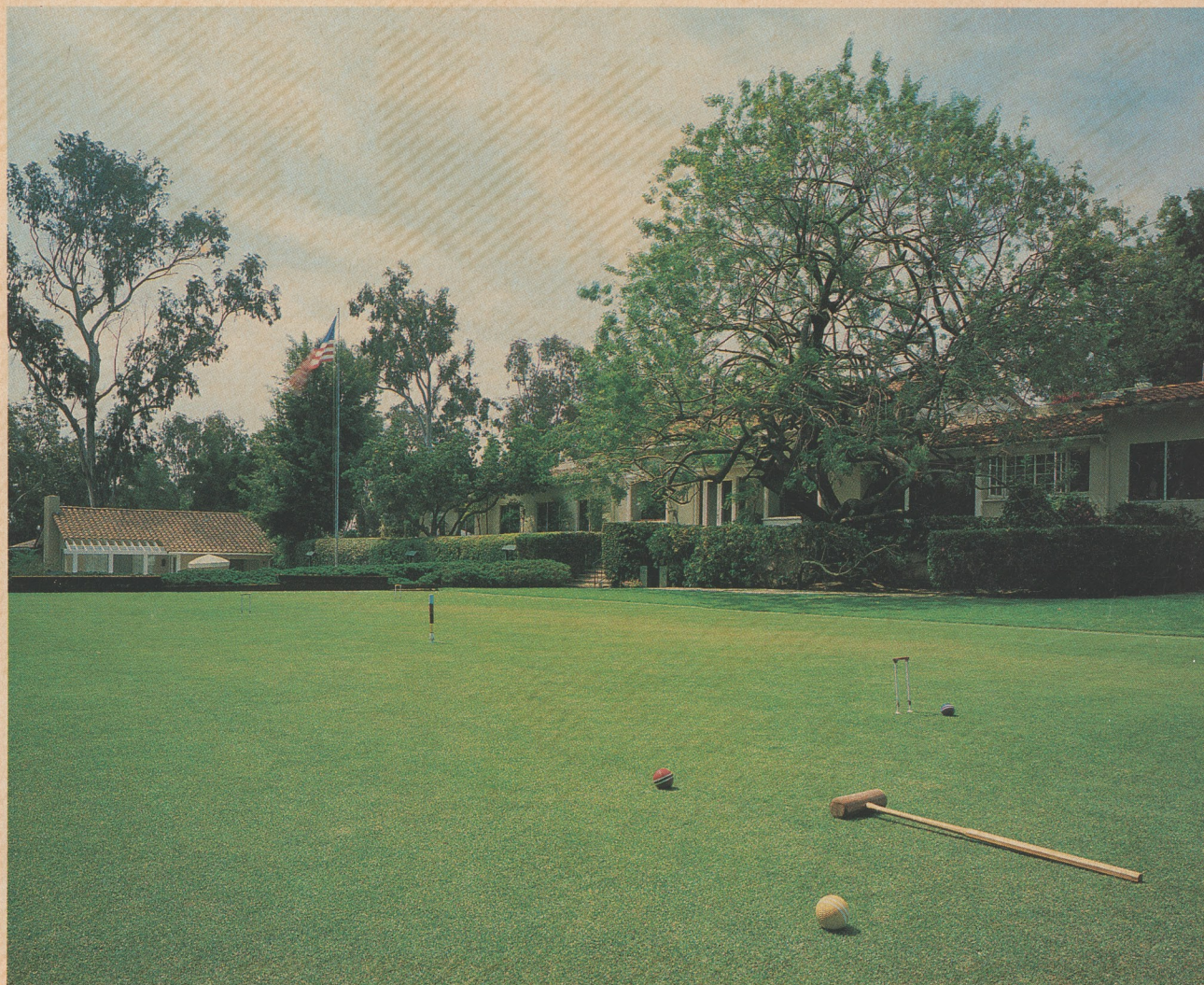
The lovely old Inn at Rancho Santa Fe is like a country estate complete with blazing bougainvillea, sweeping branches from towering Eucalyptus trees, an ancient multi-trunked Brazilian pepper tree and a game of croquet on the jade green court.

It looks like a country estate. Blazing bougainvillea, sweeping branches from towering eucalyptus over the jade green croquet court, players immaculate in white. An ancient multi-trunked Brazilian pepper tree shading the brick walkway, blocking the traffic from sight. Fresh cut flowers on the living room desks by well-thumbed copies of Fortune and Money. Crewel samplers under suspended antique model ships. Distinguished, refined, subdued.