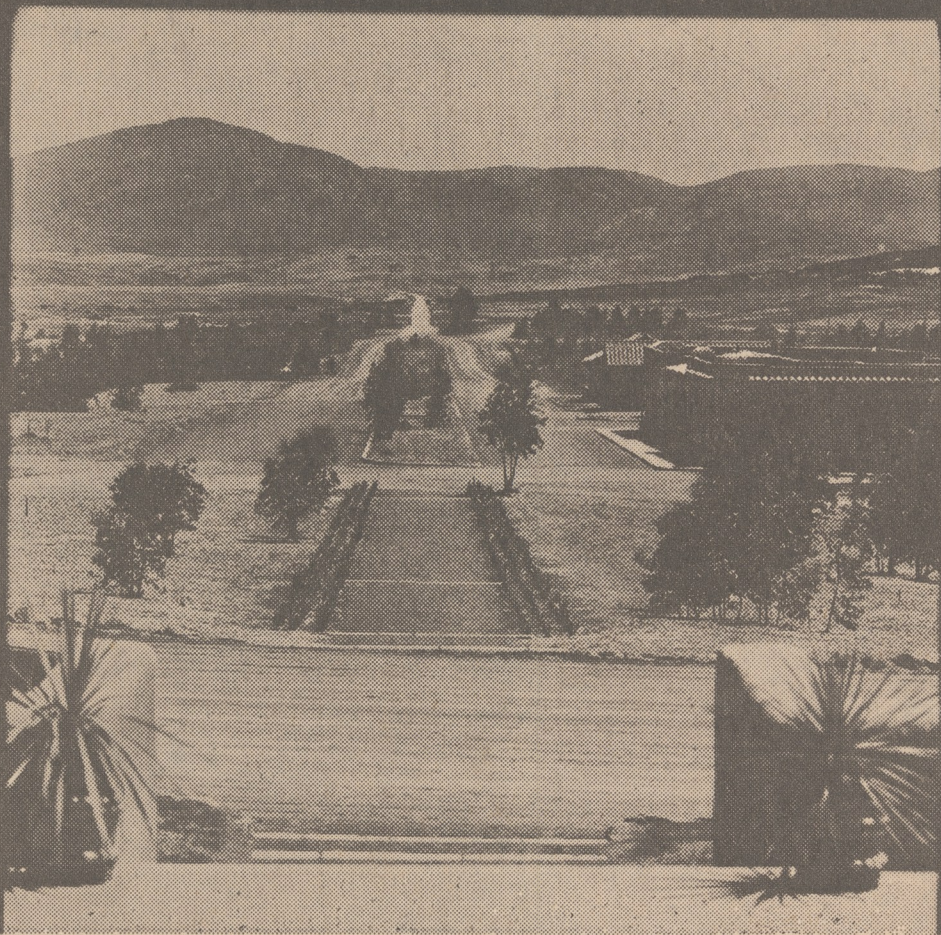
AS IT WAS—This photo was taken in 1923 through a window of the Inn at Rancho Santa Fe.