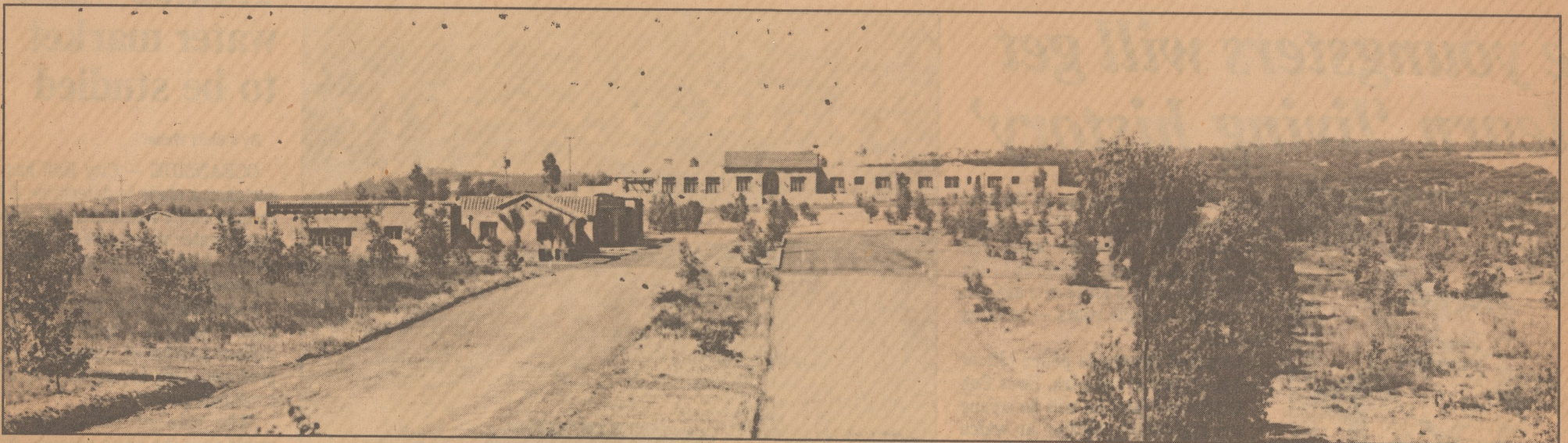
View from the west and west and the "Guest House," 1923. Paseo Delicias is traffic free.