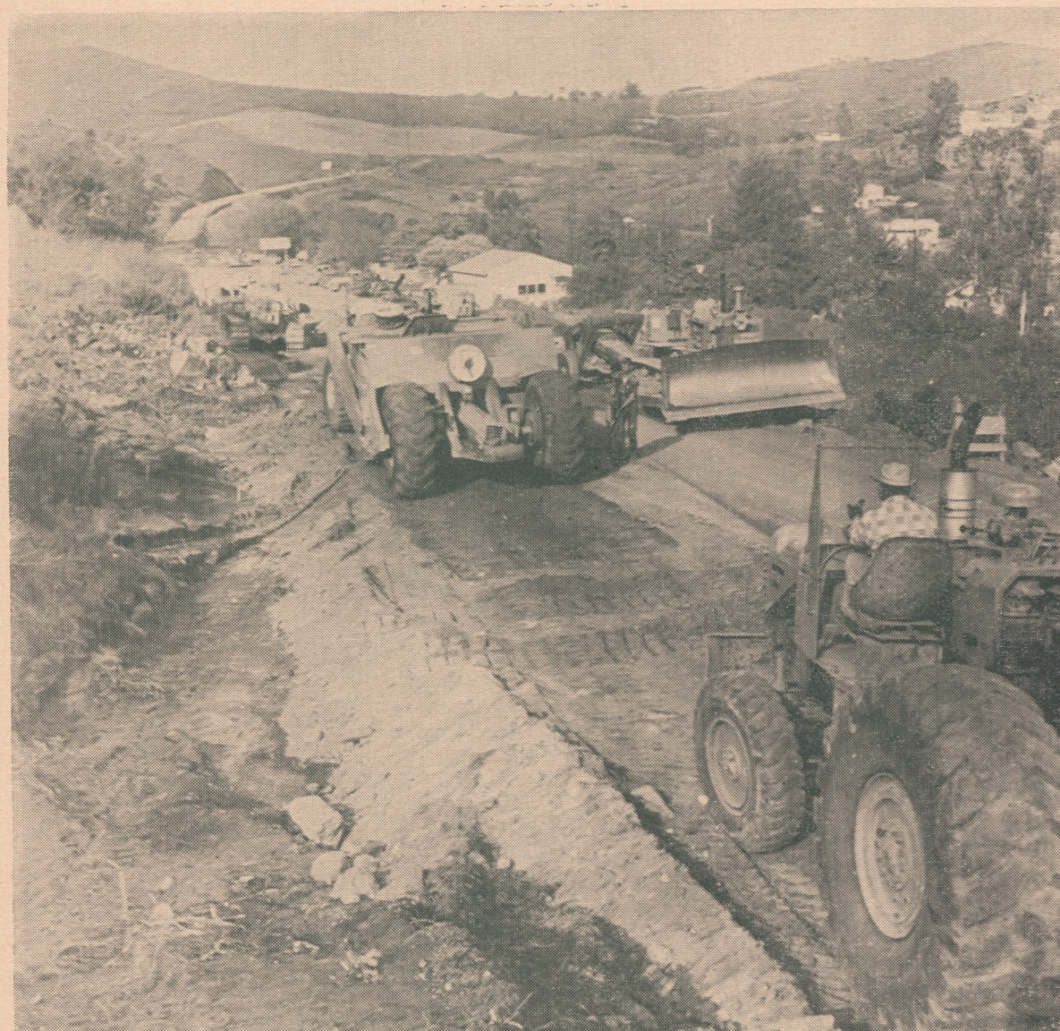
ROAD TO ESCONDIDO — Is being widened and straightened in major highway project. They're really "moving dirt" and though officially the route is open, there often are lengthy delays while groups of cars are "convoyed" through. Using the alternate route through San Marcos is advisable. When completed, this road doubtless will have heavier traffic — all the more reason for "planning" in this area for a route that will bypass the Rancho Santa Fe business district.