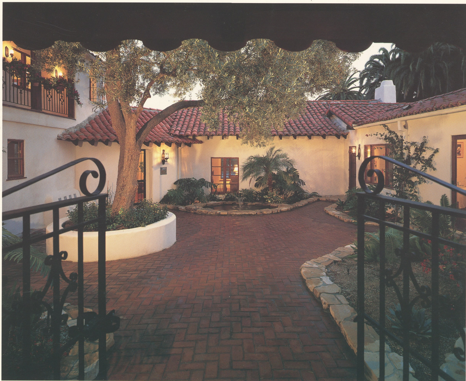
“La Casa De Los Dos Amigos” Rancho Santa Fe Covenant