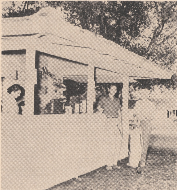
REFRESHMENT STAND —Sandwiches, soft drinks, ice cream and beer are served here to golfers during the clubhouse remodeling period. The stand, which opened March 6, took in 839 dollars during its first 10 days of operation. It is located on the first tee.