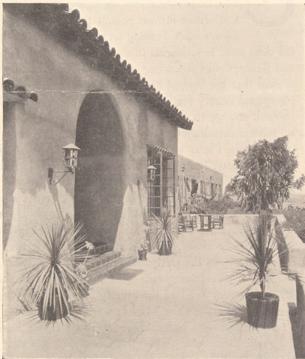
"La Morada"—Rancho Santa Fe