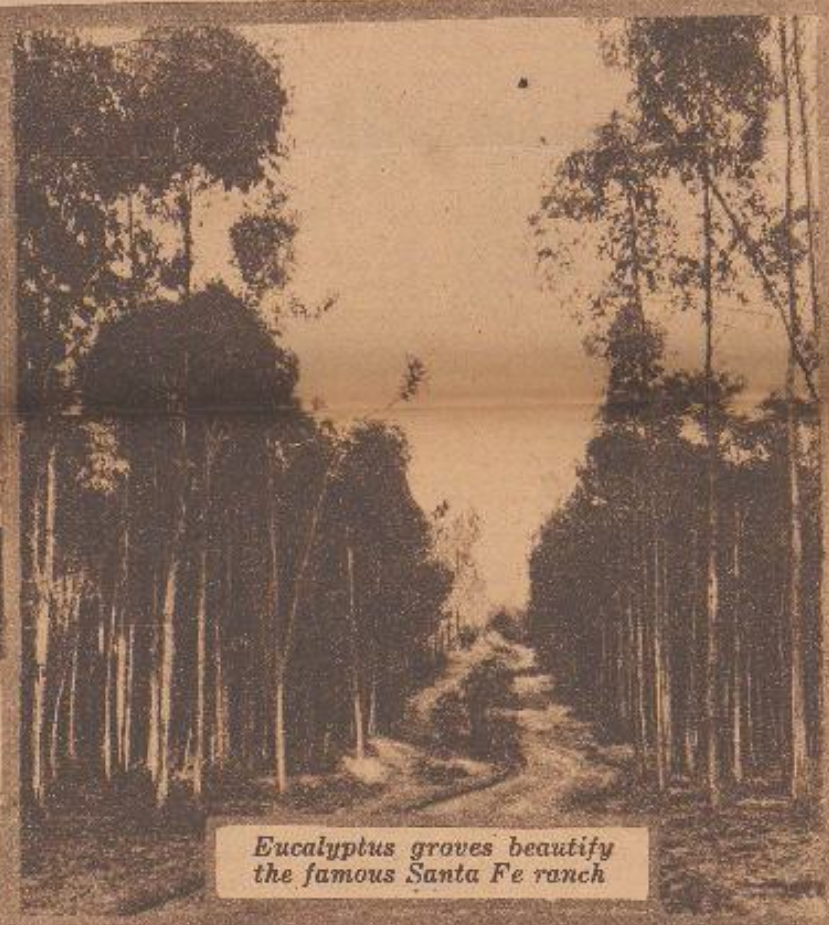
Eucalyptus groves beautify the famous Santa Fe ranch