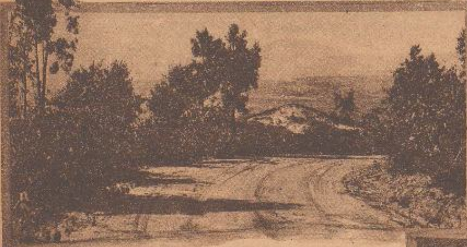
For months, crews of men have been at work laying out such roads as this one, following the contour of the rolling hills; taking advantage of natural scenic beauties.