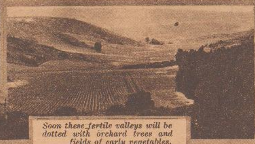
Soon these fertile valleys will be dotted with orchard trees and fields of early vegetables.