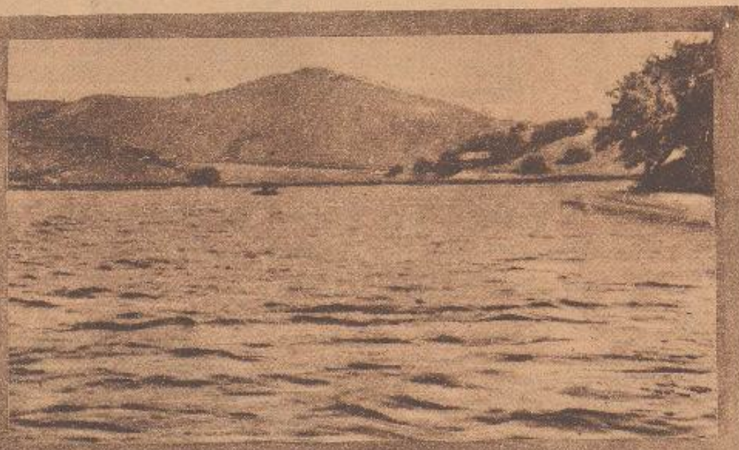
Thundering over the spillway, formerly unharnessed waters bespeak future production of bounteous crops. Lake Hodges, shown at right, has a capacity of nearly 33,000 acre feet.