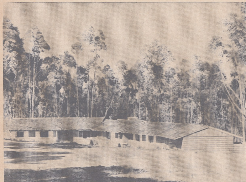
BACKGROUND — Is outstanding feature of the Charles Page residence, just completed.