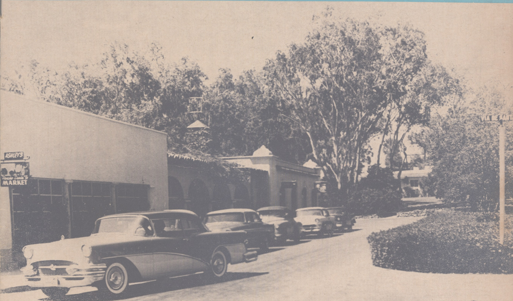
PARKING PROBLEM — No need to mention where the scene is, but it's here to illustrate that there's a parking problem in the Village which demands action toward a solution.